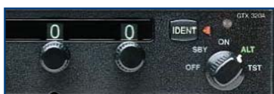
Figure 1 - a typical transponder

seen, and the main switch can select SBY (Standby - not transmitting), ON (transmitting the displayed code on Mode A only), ALT (Mode A and Mode C), or TST (Test, checking the internal circuits). To avoid transmitting an emergency code while changing selections, always switch temporarily to SBY until the new code has been set in the display.